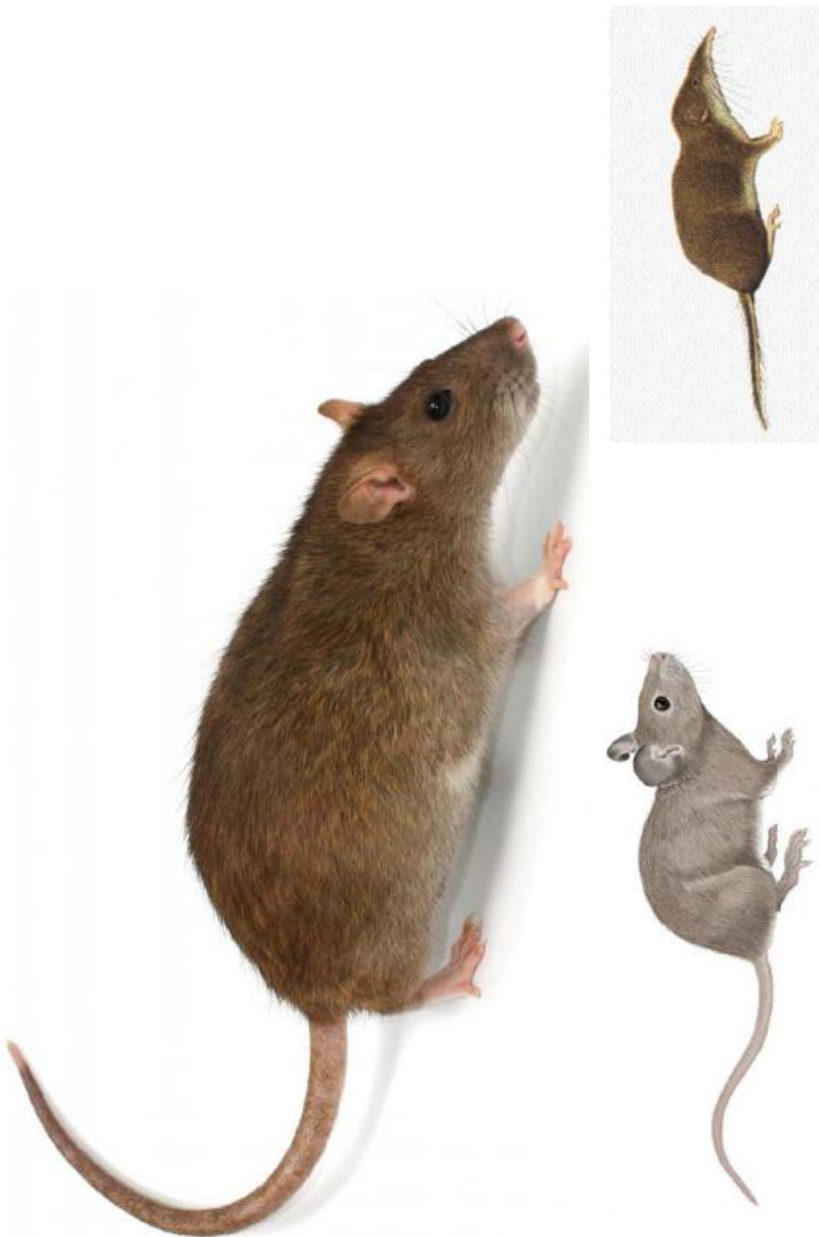
Image of brown rat compared to house mouse and Scilly shrew (Scaled, but not life size, from Bell et al. 2014)